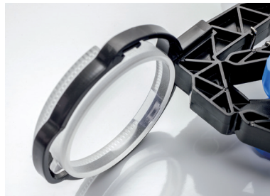
New reduction lens is designed to optimize the view of the retina and the limbus, increasing surgical efficiency