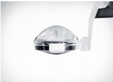
130° wide-angle field of view with outstanding resolution