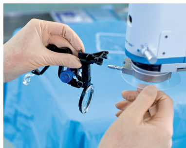
Connects easily to your microscope